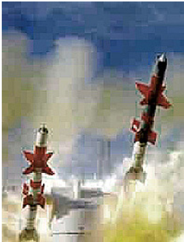
Thomas Ruff, jpeg rl104 , 2007.

But, simultaneously, a paradoxical reversal happens. The circulation of poor images creates a circuit, which fulfills the original ambitions of militant and (some) essayistic and experimental cinema – to create an alternative economy of images, an imperfect cinema existing inside as well as beyond and under commercial media streams. In the age of file-sharing, even marginalized content circulates again and reconnects dispersed worldwide audiences.