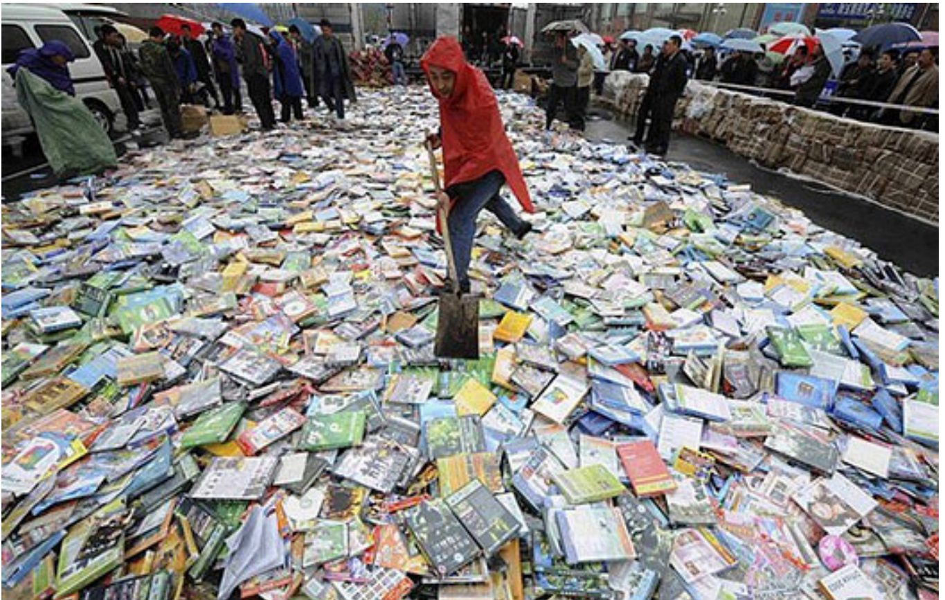
Shoveling pirated DVDs in Taiyuan, Shanxi province, China, April 20, 2008.