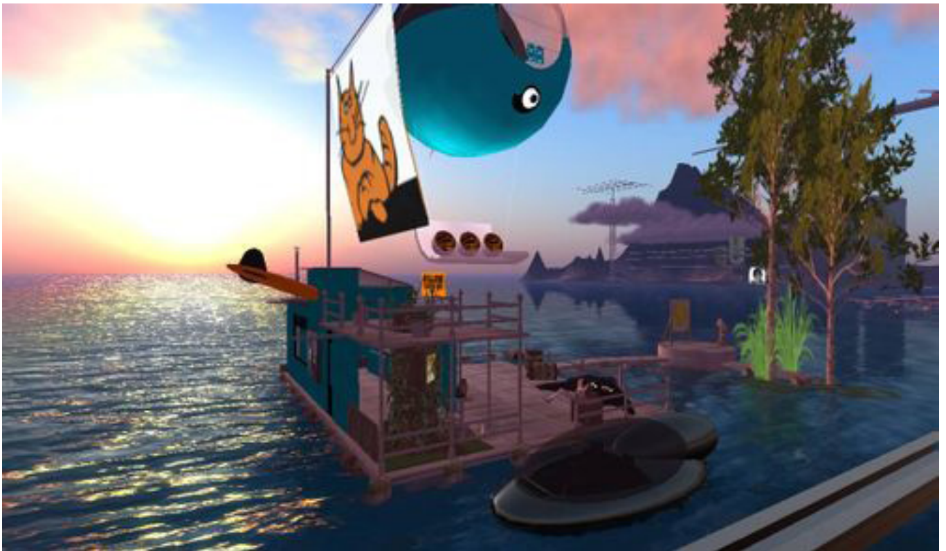
Chris Marker's virtual home on Second Life, May 29, 2009.